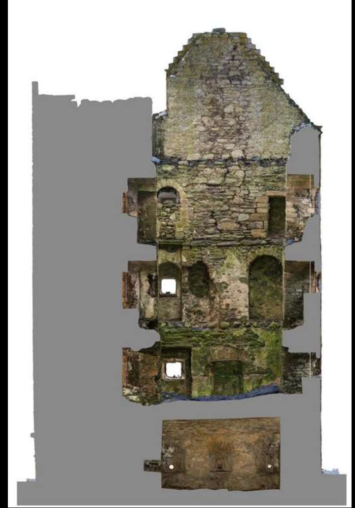
Survey Outputs: External and Internal Orthoimage Elevations