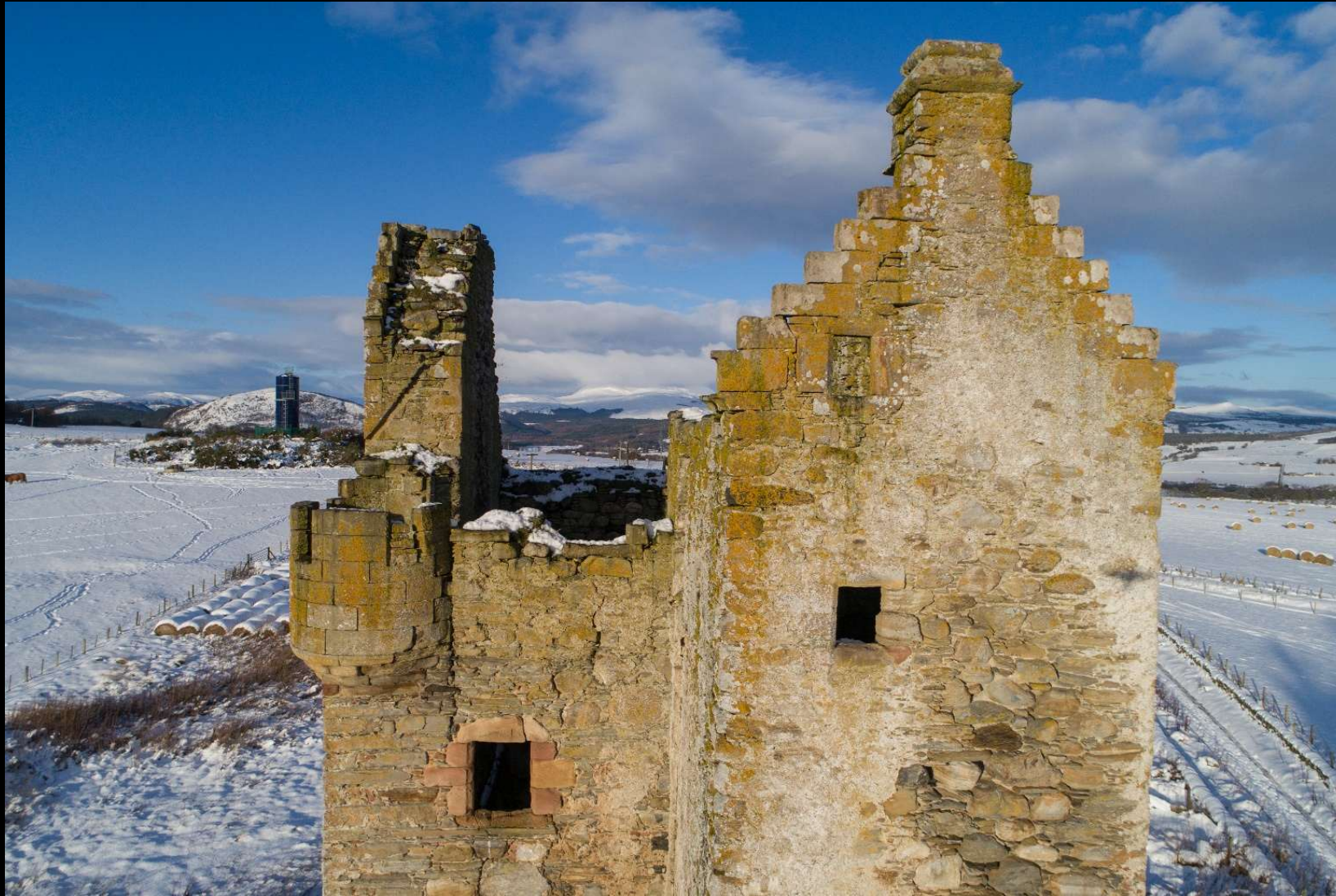
Field Survey: Drone Photography