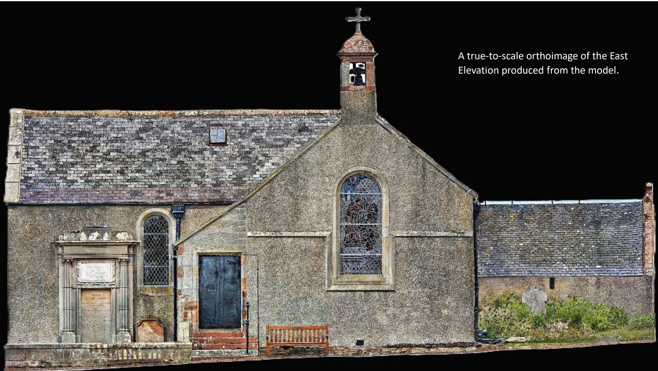
A true-to-scale orthoimage of the East Elevation produced from the model.