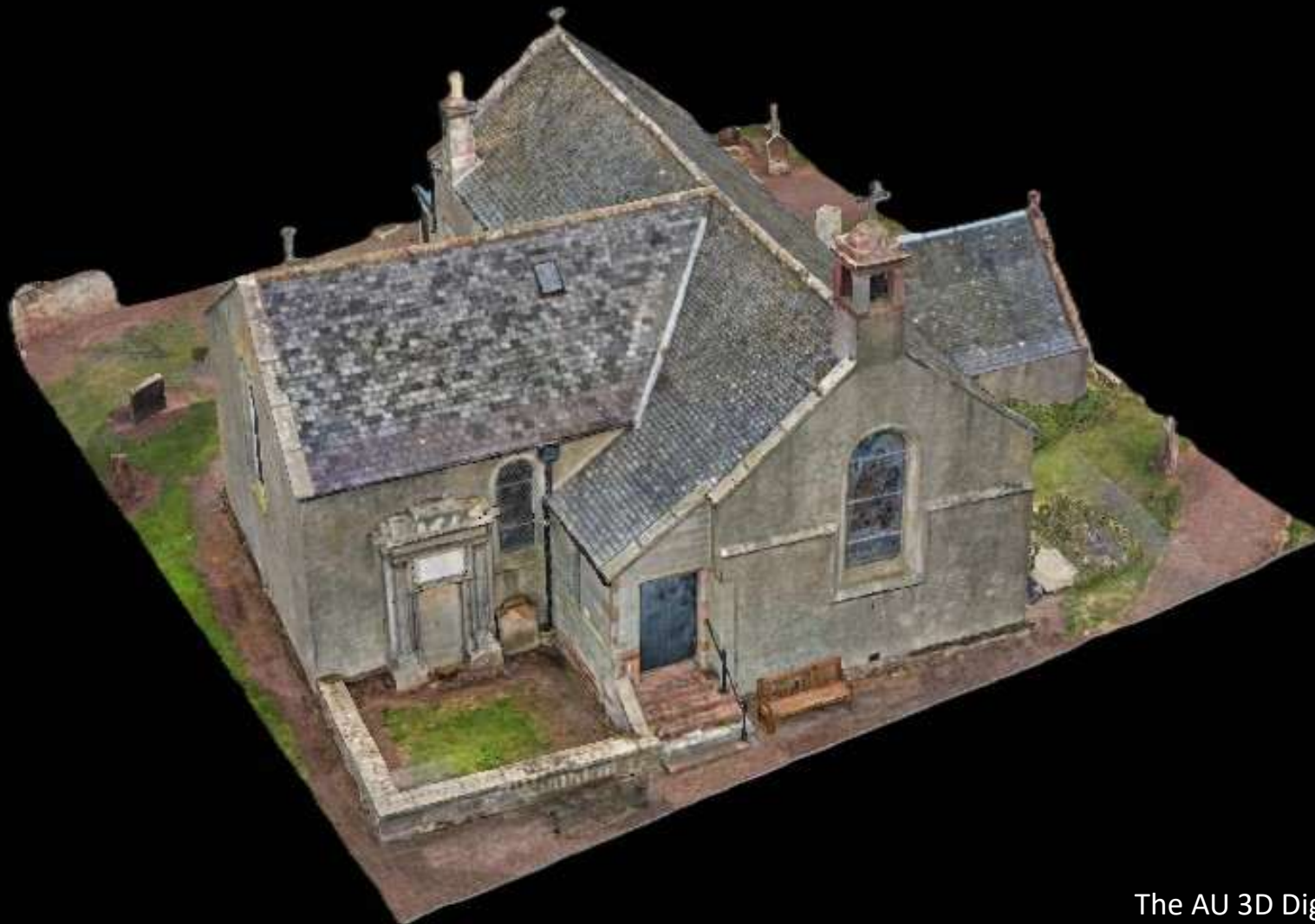
The AU 3D Digital Model