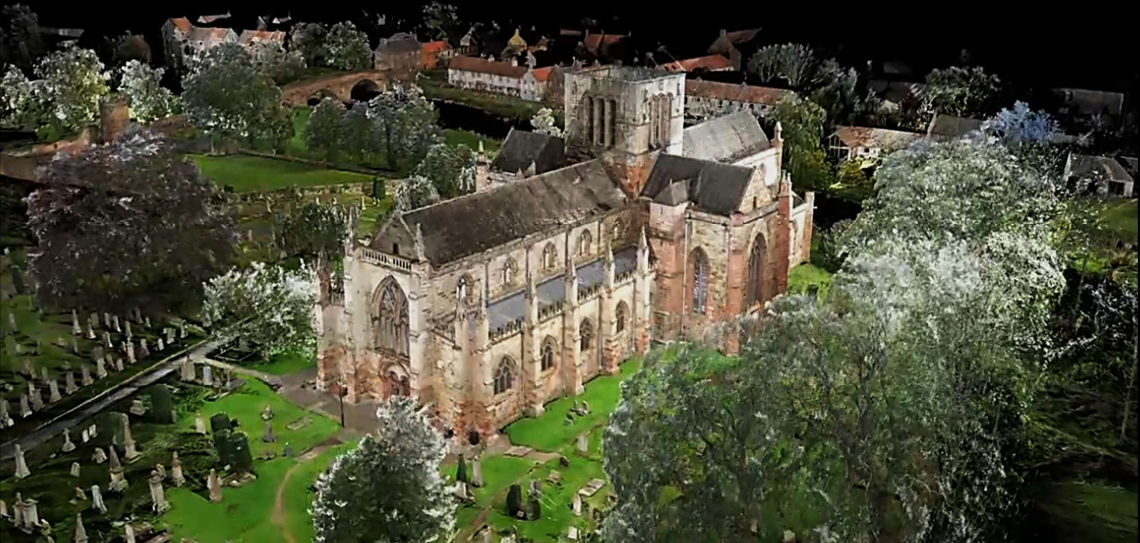
Colourised Laserscan Pointcloud