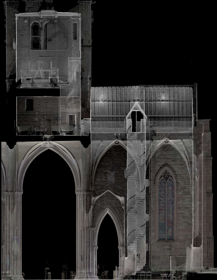
Sectional Elevation of the Crossing